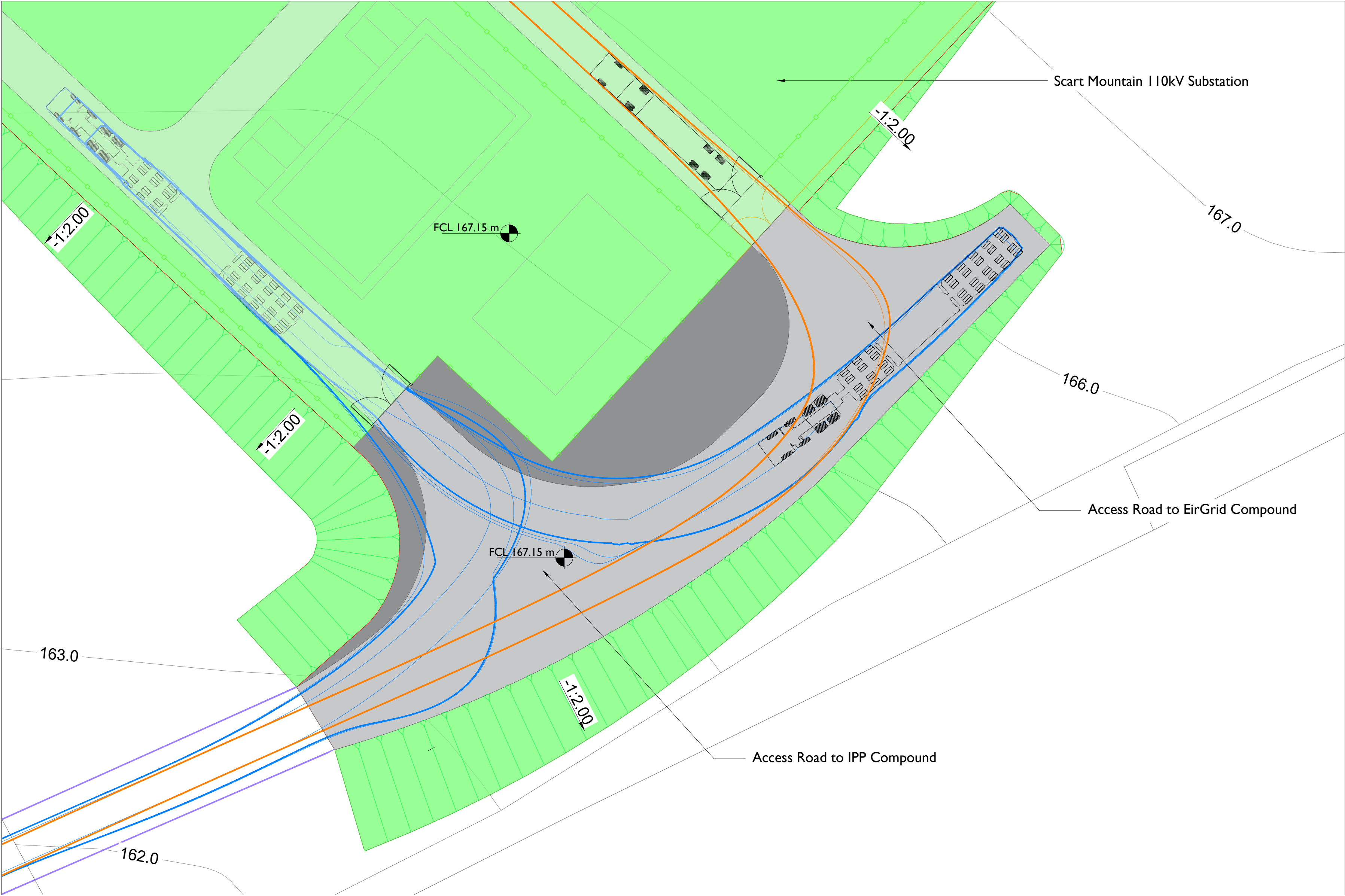
Swept Path Analysis - Proposed Access Roads SCALE 1:250

Scart Mountain 110kV Substation Compound