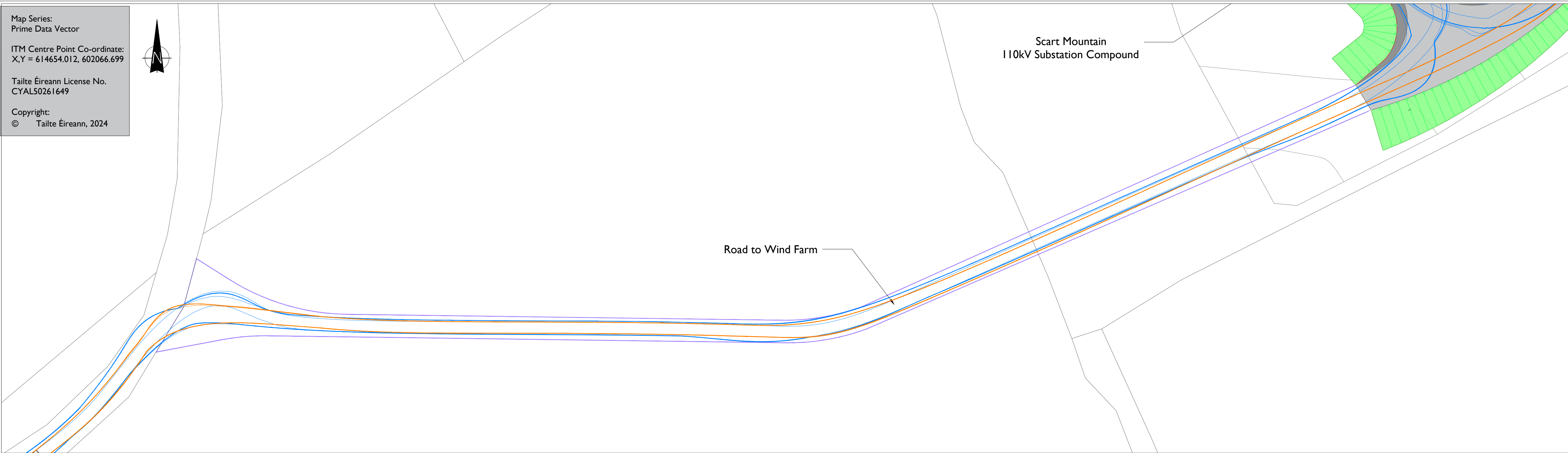
Swept Path Analysis - Road to Wind Farm SCALE 1:500